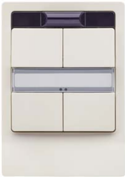
IR WALL SWITCH, DOUBLE WITH RED LED COVER TITANIUM WHITE AP421/3