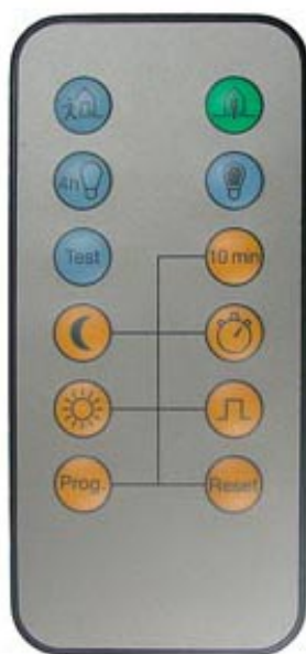
DELTA REMOTE CONTROL F.SURFACE-M.MOTION DETECTOR IP5 ANTHRACITE